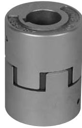
Curved Jaw Coupling